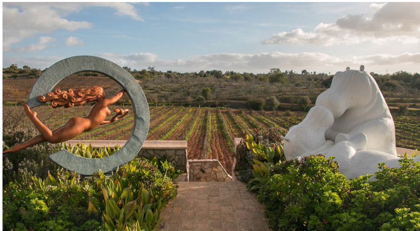
Quinta dos Vales